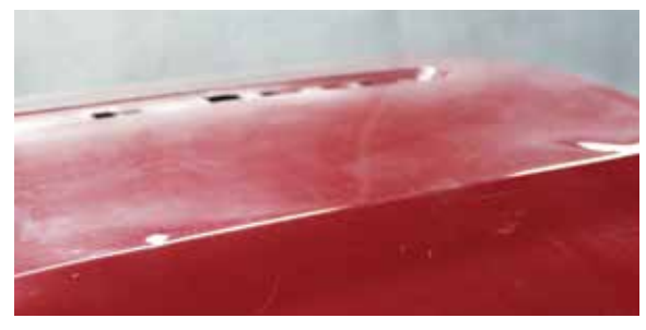
Corona treatment reduces the risk of imprinting on damp vehicles